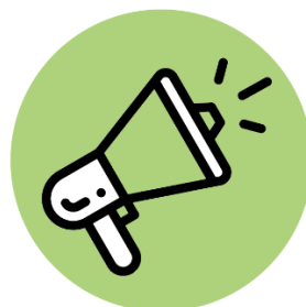
PROMOTE FUTURE COMPLIANCE