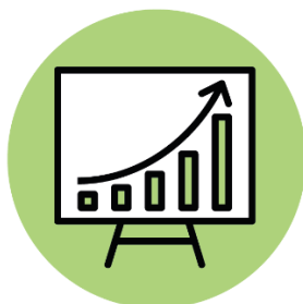
INCREASE CURRENT COMPLIANCE RATES